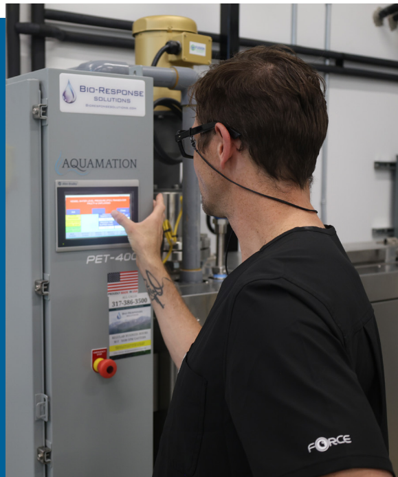
TillWell officially opened its doors to the public for pet aquamation services in May.

glad that I went to that," said the entrepreneur, who expressed excitement towards the MMF's developing tree nurseries, which he hopes to partner on. "My hope in the future would be that we could buy the vast majority of the trees (that) they plant every year from them, so that would be great if they could be a major resource for us."